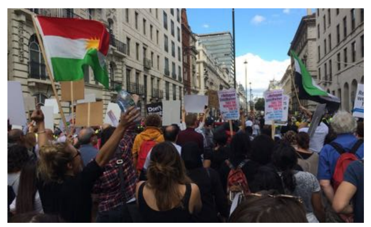
Thousands attend the Solidarity with Refugees March in London

In an attempt to call on the UK government to accomplish much more and expand its refugee relief efforts, thousands of people, including MPs and celebrities joined the marches organised in support of refugees in Central London in September 2015 and 2016.<sup>7</sup> This was a clear demonstration of the eagerness of ordinary citizens to have a say in the current refugee crisis and find ways to participate in refugee protection.